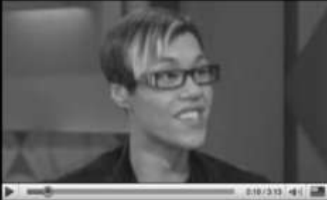
Gok Wan, television presenter