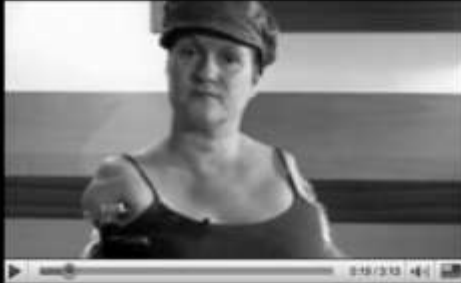
Alison Lapper, artist

2008 saw the launch of the Commission's YouTube channel. Our 'Equally Different' campaign features videos of individuals from all walks of life. Visit www.youtube.com/equalityhumanrights